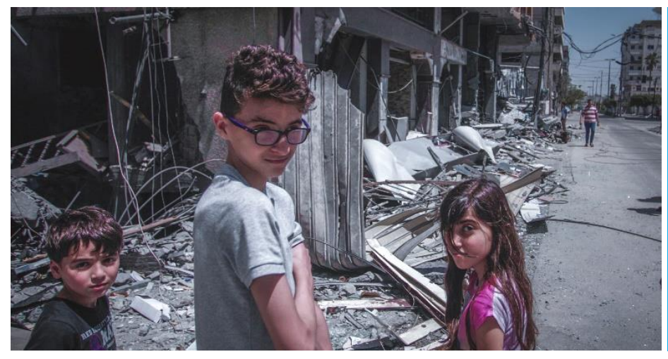
A Palestinian boy and his younger siblings visiting their completely demolished home in the Gaza Strip.